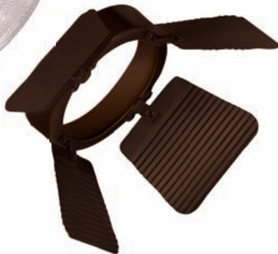
PAR30 - Barn Door Accessory