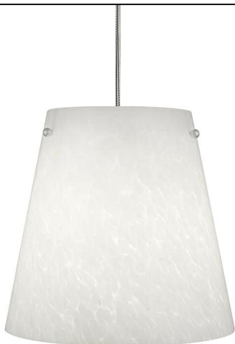
White Frit Shown approx. 25% actual size.