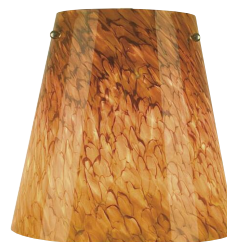
Tahoe Pine Amber