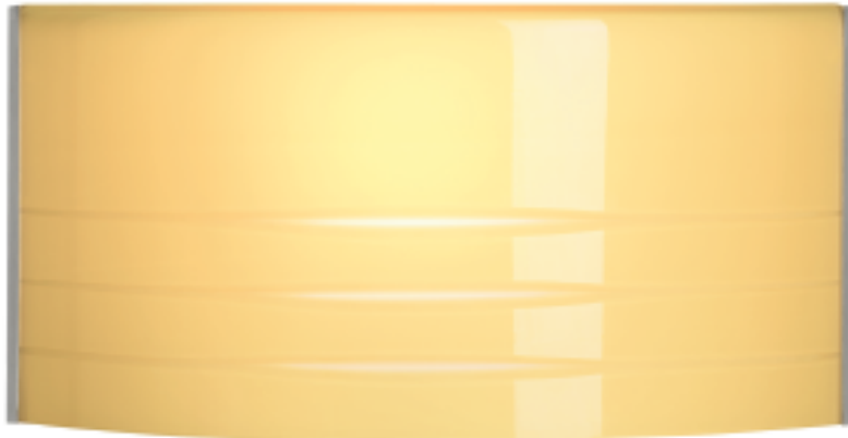
Amber/White Shown approximately 30% actual size.