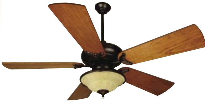
Oiled Bronze Phoenix with 54" Premier Distressed Oak Blades and Bowl Light Kit

Model-Finish PX520B Blade-Finish B554PD-OAK Light-Finish LK24-OB