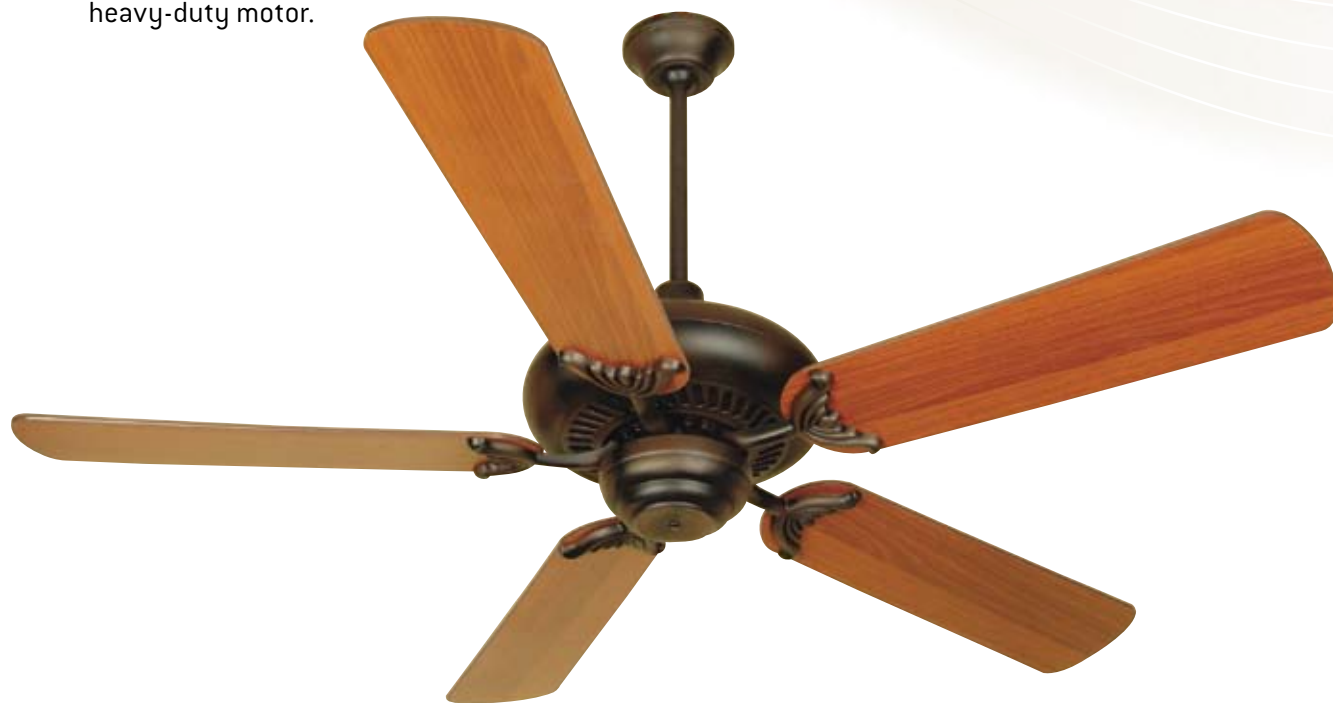
Old Iron Phoenix with 52" Plus Series Cherry Blades

The Phoenix Series features smooth contours and custom blade arms, all with our heavy-duty motor.