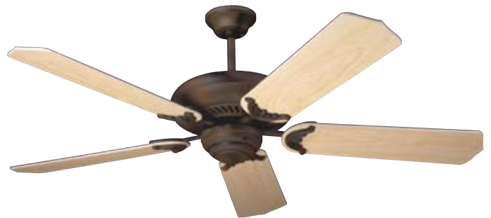
Old Iron Phoenix with 52" Standard Maple Blades

Model-Finish PX52AW Blade-Finish B552S-AW Light-Finish Not Shown