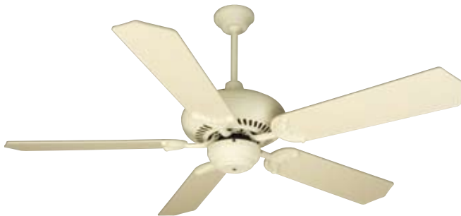
Antique White Phoenix with 52" Standard Antique White Blades

Model-Finish PX52BN Blade-Finish B552P-WWB Light-Finish Not Shown