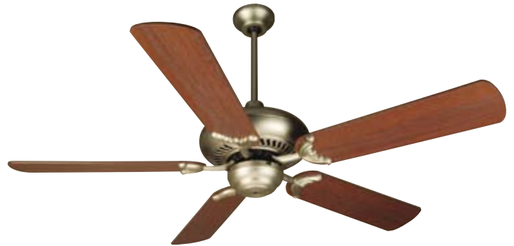
Brushed Nickel Phoenix with 52" Plus Series Washed Walnut Birch Blades

Model-Finish PX520B Blade-Finish B554PD-OAK Light-Finish LK24-OB