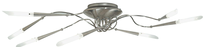
ARIA CEILING Shown approximately 10% actual size.