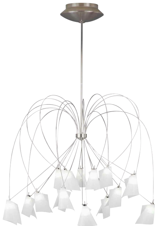
RHAPSODY Shown approximately 5% actual size.