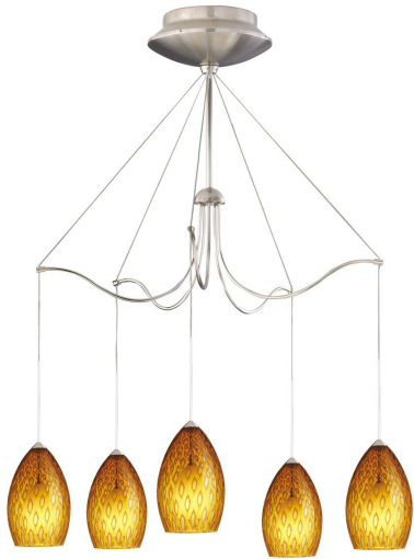
SERENADE WITH FIREBIRD OWL PENDANTS Shown approximately 5% actual size.