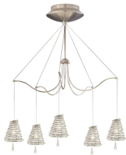
SERENADE WITH CRYSTAL BEDAZZLED PENDANTS