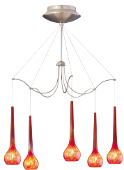
SERENADE WITH SAVOY RED PENDANTS