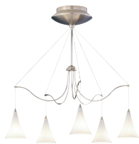
SERENADE WITH MINI MELROSE WHITE FRIT PENDANTS