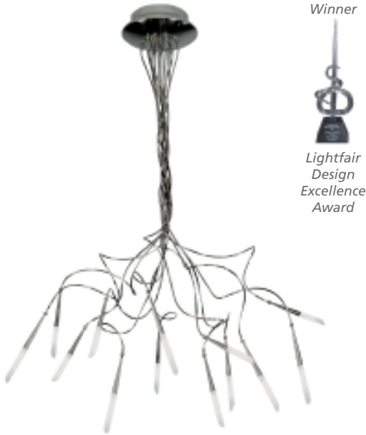
SYMPHONY Shown approximately 5% actual size.