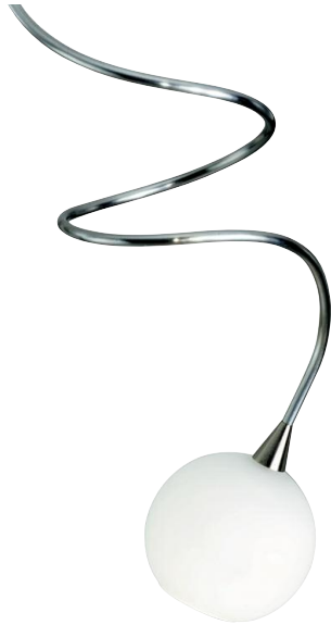
CURLY MOON Shown approximately 30% actual size.