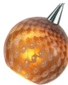
CURLY OWL MOON