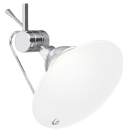
SPROCKET WITH SHY ACCESSORY