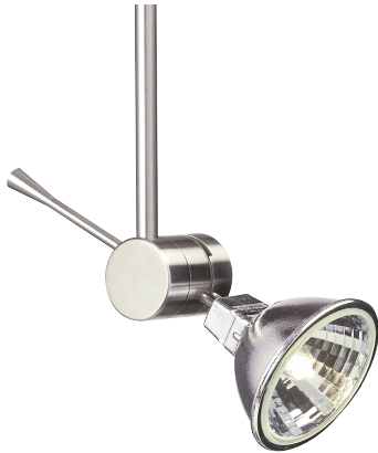
SPROCKET Shown approximately 55% actual size.