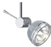
SPROCKET WITH MESH BACKLIGHT SHIELD ACCESSORY

Socket terminates with FreeJack male connector, which may be installed into a system connector. Elements ordered with a system prefix include a |connector for that system.