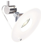
SPROCKET WITH SPY ACCESSORY