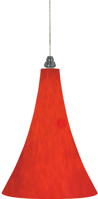
FERRARI RED, LARGE