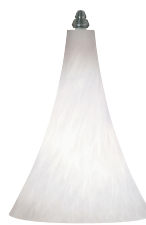
WHITE FRIT, LARGE