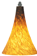
TAHOE PINE AMBER, LARGE