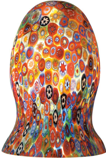
SOPHIA Shown approximately 50% actual size.